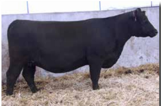
SEAGRAVES RITA 2044