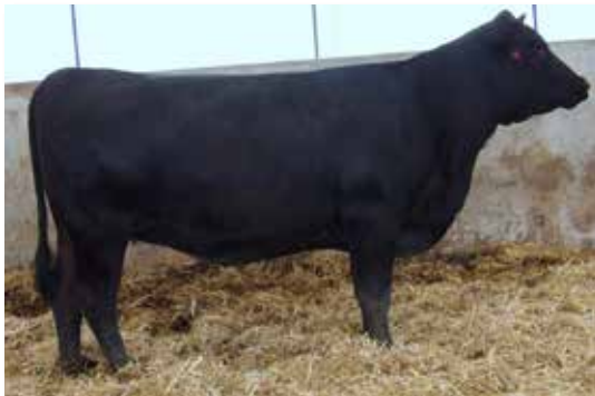
SEAGRAVES RUBY 2071