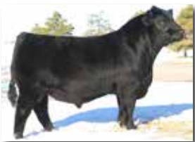
DAMERON FIRST CLASS PGS OF LOT 45

Cow DOB: 10/16/21 Tattoo: 28 Reg: 20406978 Jindra Acclaim BW 52 Fwf Acclaim 028 WRR Forever Lassie 668 WR Journey-1X74 WRR Forever Lassie 668 WRR Forever Lassie 161