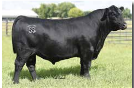
S S BRICKYARD