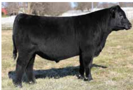
VIRGINIA TECH STATESMAN & SERVICE SIRE FOR LOT 38B