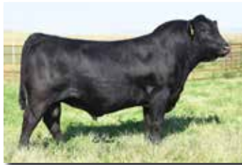
BYERGO BLACK MAGIC 3348 MGS OF LOT 9 & 11

Magic Sam A54 ranks top 1% for WW and dairy value and top 2% YW and RADG. Sam has amazing balance with 19 EPD's in top 10% and 14 EPD's in top 5% of Angus breed. 5 of 6 $Value Carcass value of 1.22 RE and 1.07 Marb and +73 CW with negative FAT. Sam qualifies as Angus seed stock. He excels in $Value with 5 of 6 in top 5% or higher.