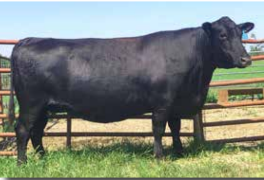
E-LEE MAYFLOWER AZALEA 803 DONOR FOR LOT 60