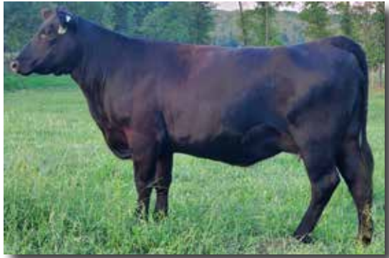
GUFFEY'S BLACKCAP 234