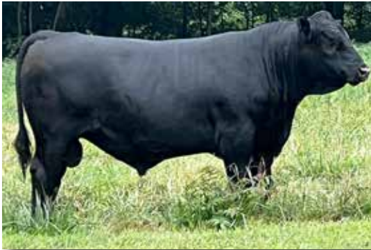
BAR SOUTH SIDE TRUEMAN