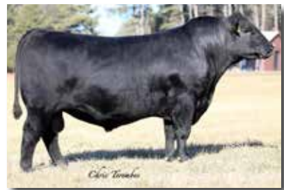
QHF WWA BLACK ONYX 5Q11 MGS OF LOT 44

Consigner: Flying W Farms Kyle Wake 417-252-1399 This young female is one of the most unique females we have seen in a while. With a popular pedigree blending the semen sales leader at ST Genetics and Black Granite. Not to mention she has an extremely balanced set of EPDs that boast 15 EPDs in the top 25% of the breed including all value indexes. She is a 3/4 sister to the 101 heifer in this sale; her dam is extremely productive with a 323 day calving interval and a neat udder.