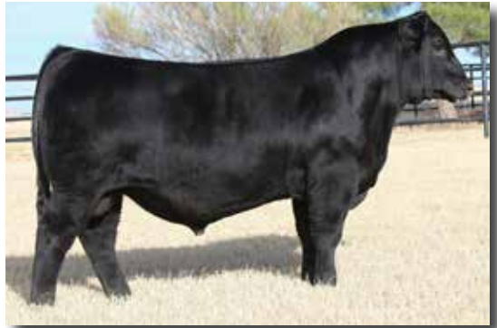
WILKS REGIMENT 9035 SIRE OF LOT 33A & SERVICE SIRE FOR LOT 34