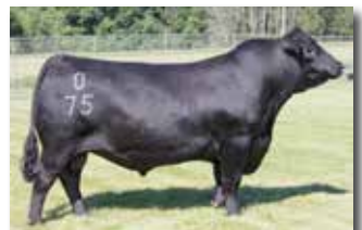
LAR MAN IN BLACK SERVICE SIRE FOR LOT 37