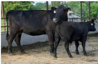
4N MEDICINE WOMAN 520