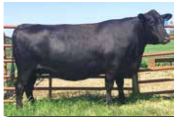
E-LEE MAYFLOWER AZALEA 803 DAM OF LOT 8 & 10

Master A56 ranks top 4% or higher YW, RADG, RE, negative Fat, $C, $B, and $G. Master is Angus seed stock qualified. Top 10% WW at +80 and top 1% for RADG. Master is well balanced with 10 EPD's in top 10% and 17 EPD's in top 15% or higher of Angus breed. 5 of 6 $Value Carcass value of 1.13 RE and +.98 Marb and +61 CW with negative FAT of -.062. Sam qualifies as Angus seed stock. He excels in $Value with 5 of 6 in top 15% or higher.