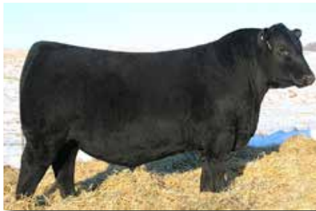
S A V BLOODLINE 9578