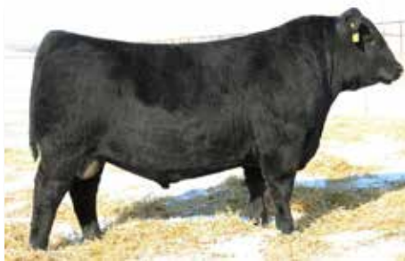
S A V EARLY ARRIVAL 0903