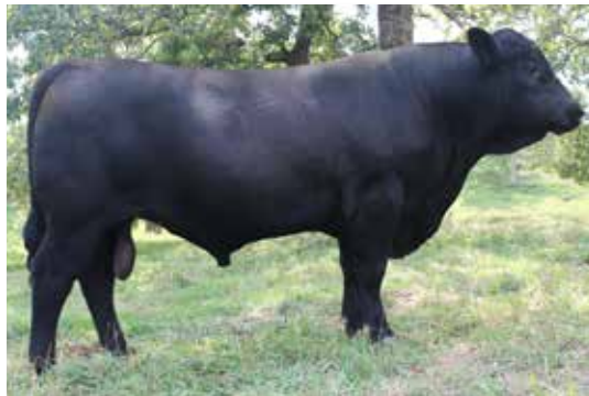
WRR NEXT GEN 130

Consigner: Wiles Ridge Ranch Truman Wiles 417-252-0726 BALANCED EXTREMELY GENTLE NEXT GEN SON. His dam is a very productive cow with an average weaning weight ratio of 105 on 4 calves. 130 has a very good set of EPD's with a Top 35% WW EPD, and Top 35% YW EPD. His mother is an excellent milking cow and 130 has a Top 25% Milk EPD of 30. His TOP 3% Docility EPD is reflective of his calm easy going personality. This is a bull that can add body length and thickness to your calves.