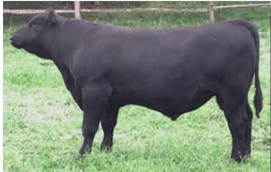
SYDGEN RESOLVE 1955