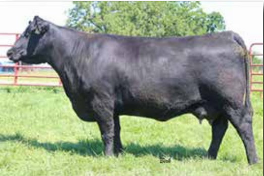
MEAD PRIMROSE N198 PGDS OF LOT 47 & 48

Consigner: DHT Angus Cecil Huff 417-250-1300 Rose has good balance with 16 EPD's in top 10% or higher. 5 of 6 EPD's for maternal at top 10% or higher. Rose excels in $Value with all 6 above breed average with $W at top 4%. Rose goes back to Mead Magnitude one of the top sire groups at S A V 2021 sale .