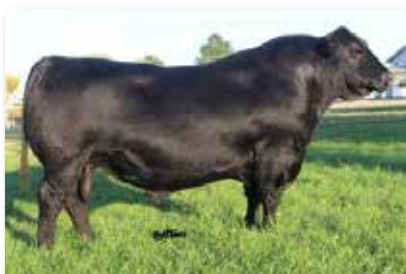
SYDGEN KCF GAVEL 8361 SIRE OF LOT 17