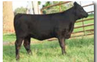
AF MISS GLENDA 422