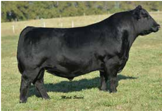
PVF INSIGHT 0129 SIRE OF LOT 5

Consigner: Sinning Cattle Company Chris & Amber Sinning 417-849-6417 Here is a very stout insight son out of a great cow we bought from Don Ely. He is a moderate frame easy keeping bull that will make a very good herd bull. Be sure to note the growth and carcass traits on this extremely phenotypical bull, TOP 5% CW and TOP 1% RE, with +71 WW TOP 25% and +.29 RADG Top 20%. Check him out on sale day, as he hits all the marks of this sale and more; Power, Performance, Pedigree, ..... and Phenotype!