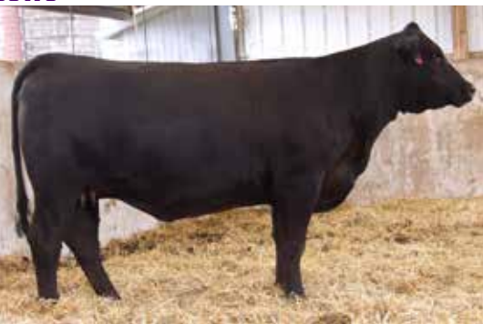
SEAGRAVES RUBY 2074

All Seagraves Angus Females Calf Hood Vaccinated for national travel