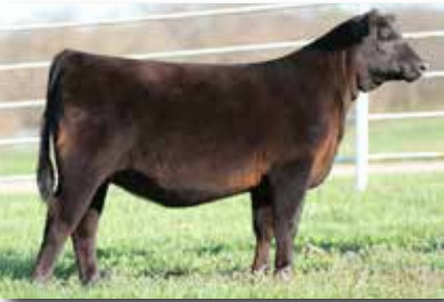
WALLACE BLACKBIRD 9164 DAM OF LOT 49

Consigner: DHT Angus Cecil Huff 417-250-1300 Maid 454 A75 ranks top 1% for DOC, top 3% for CED, CEM, $M and $W. Top 20% or higher for Milk, $F, RE, Angus on Dairy, $C, WW and YW. Maid 454 A75 goes back Black Granite on bottom side. Mead Magnitude on of the top side. Magnitude sired one of the top sire group at SAV sale.