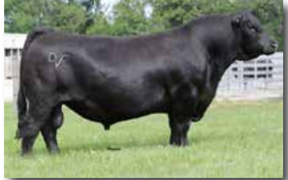
DEER VALLEY GROWTH FUND SIRE OF LOT 60