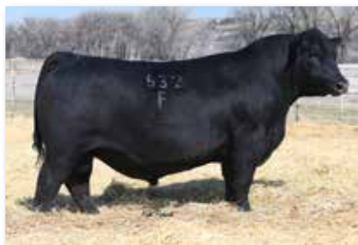
SITZ BARRICADE 632 F SIRE OF LOT 32A