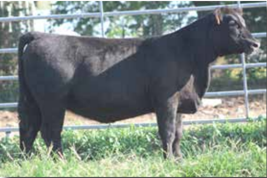
VLF BRITTANY 03K