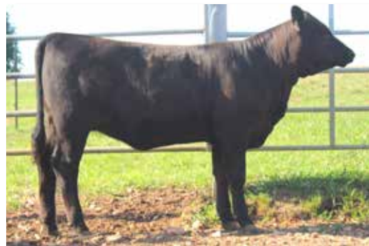
VALLEY VIEW MARY 243

Consigner: Valley View Angus Farm Lynn McElhaney 417-732-7588 Mary 243 is true spread female, in an extremely thick package. The mating between 743 and Dual Threat has proven to be a real winner! Note her +11 TOP 15% CED that explodes into a +117 YW. She is a +.98 on Marb and +.95 RE. Be sure to circle her excellent $B and $C numbers both TOP 10%. This is front pasture female with loads of potential!