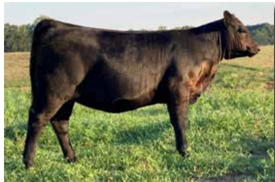
GPN QUEEN 2N5

Offering 3 embryos sired by Deer Valley Growth Fund(Reg #18827828) or EXAR Grenade (Reg #19358194). Growth fund is the only bull in the breed at his accuracy level of CED (+10 @ .86 acc) and WW (+90 @ .95 acc), and will be full sibs to the Hedge Fund bull offered in this sale. Exar Grenade sired the $100,000 valued top bred heifer at the recent Express Ranch Sale. Grenade has an impress set of EPDs; +98 WW, and has 18 EPDs/$Values in the top 15%. Either mating will provide "Top of the Breed" offspring both in phenotype and genotype. Guaranteeing 1 if implanted by a certified embryologist. Bring your tank and pick them up sale day or shipping available at buyers expense.