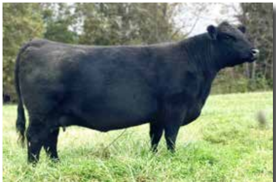
GPN QUEEN 7N11 DAM OF LOT 52