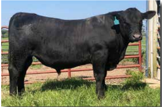
E-LEE MAYFLOWER ARTILLERY

Artillery - The ONLY Regiment son in the breed (out of 432) with at least +90 WW, +2.06 SC, and $341 $C. He also boasts 18 EPD's/$Values in the TOP 15% of the breed for multi-trait excellence. His dam E-Lee Mayflower Azalea 803 is the TOP Donor at E-Lee Angus, with 13 of her EPD's being TOP 5% or better. Artillery is deep and long like his beautifully balanced Dam. He is ready to win, at producing the most profitable offspring.