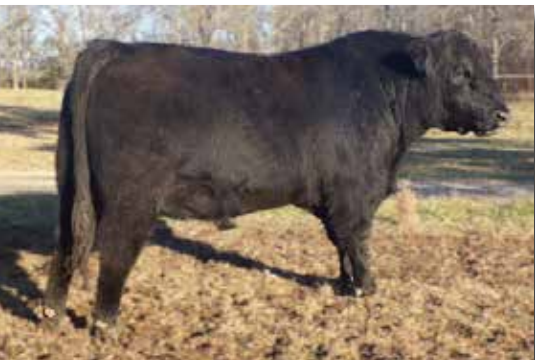
FWF ACCLAIM 028 SIRE OF LOT 46

Consigner: Flying W Farms Kyle Wake 417-252-1399 This moderate framed heifer has 10 epds in the top 35% of the breed. Her dam is carrying a 365 day calving interval, a 101 weaning ratio and a 101 yearling ratio. She has also weaned her calves off at almost 60% of her body weight on average. I look for this heifer to follow in her mothers footsteps. This heifer also carries a neat pedigree going back to traveler, 036 twice, Destination 727 twice and the great B/R Ruby cow family twice.