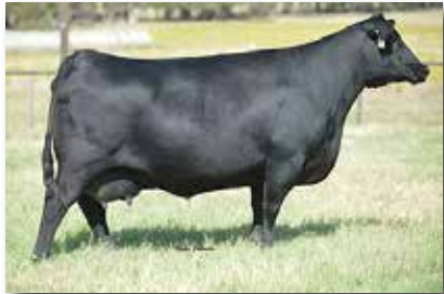
MONARCH RITA 1106 MGD OF LOT 14