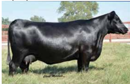
44 RUBY 2357

Online Bidding Available www.LiveWireAuction.com