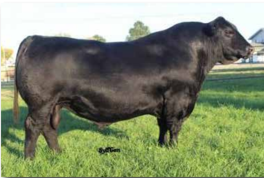
SYDGEN KCF GAVEL 8361 SIRE OF LOT 42 & 43

Consigner: Blue Mound Angus Fred Swartzentruber 417-327-3752 BMA Erica 129 is sired by SydGen KCF Gavel, the $240,000 valuation sire at SydGen. Top 1% +206 for $B and Top 1% +331 for $C. Her Dam is sired by exceed and considered one of the best animals at the Blue Mound Angus Program. Of the EPD's required for this sale she is 1 of only 2 non-parent cows in the entire angus breed that have this level of excellence. Be sure to look over this female as she is donor potential, with 15 of her EPDs being TOP 10% or better.