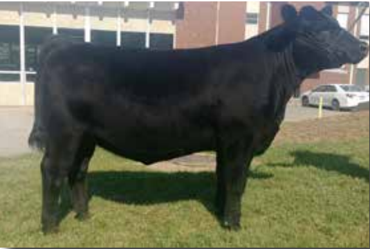
SINNING'S QUEEN LASS J9