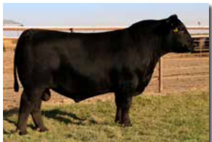
V A R REVELATION 6299 SIRE OF LOT 9 & 11