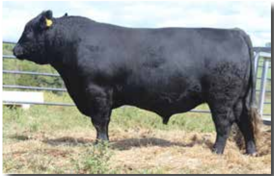
WRR DISCOVERY 609 SIRE OF LOT 51