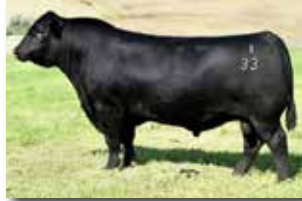
CONNELLY BLACK GRANITE SIRE OF LOT 35A