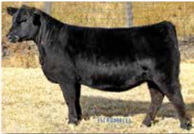
GV-K3J IREENE 008 DAM OF LOT 50