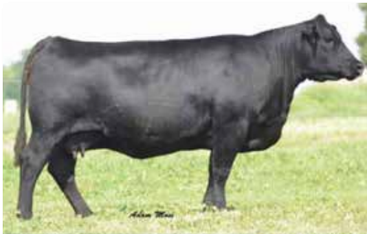
44 RUBY 6567 DAM OF LOTS 38A & 38B