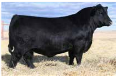
SQUARE B TRUE NORTH 8052 SIRE OF LOT 16

Consigner: Blue Mound Angus Sheldon Swartzentruber 417-327-5885 BMA Gavel 148 is sired by SydGen KCF Gavel, the $240,000 valuation sire at SydGen. The Top $C Bull of his calf crop at 354 $C. His dam is one of my favorite cows for looks, she is a "Model Angus Cow". 148 has an excellent phenotype as well, and his TOP 15% Claw and TOP 5% Angle EPDs. Show-Me-Select calving ease, with TOP 1% $B, $C, and RE.