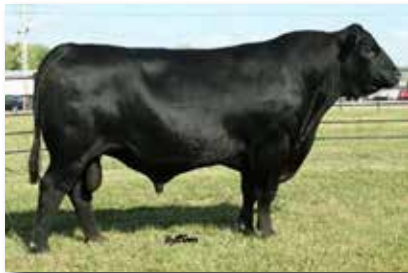
SYDGEN EXCEED 3223 MGS OF LOT 42

Consigner: Blue Mound Angus Fred Swartzentruber 417-327-3752 BMA Rita 132 is sired by SydGen KCF Gavel, the $240,000 valuation sire at SydGen. Top 1% +220 $B, and Top 1% +333 for $C. Blue Mound Angus has used 100% AI Sires and no clean up bulls for the last 18 years. BMA Rita 562, is an excellent producer with a very nice udder. Be sure to circle her +1.48 Marb TOP 1% EPD and Genomic Rank, as well as +163 TOP 1% YW EPD and Genomic Rank. 132 is extremely sound and has excellent Claw TOP 15% and Angle Top 10% scores. 132 really hits all the marks, and is primed to go into your donor pen.