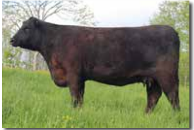
WRR FOREVER LASSIE 938 FLUSH SISTER TO DAM OF LOT 13