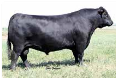
CONNEALY CONSENSUS 7299 PGS OF LOT 30

All buyers invited to view the sale animals morning of sale day