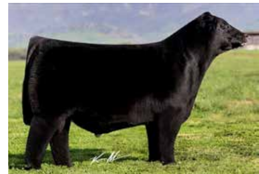
COLBURN PRIMO 5153 SIRE OF LOT 32