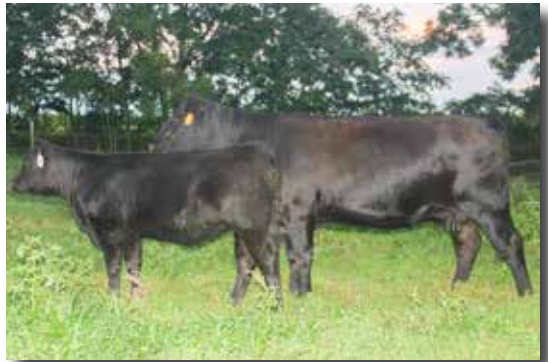
AF MISS GLENDA B6 1618 & AF MISS GLENDA 422