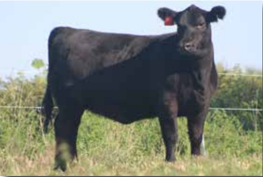
VLF BIRDIE 01K