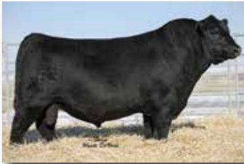
BUBS SOUTHERN CHARM AA31SIRE OF LOT 14

Consigner: Flying W Farms Kyle Wake 417-252-1399 This bull by Southern Charm will add frame in a balanced calving ease package. He carries 15 epds in the top 25% and is backed by the great Spruce Mountain Rita cow family. Don't miss this bull on sale day as he will add value to your herd in every part of the industry.