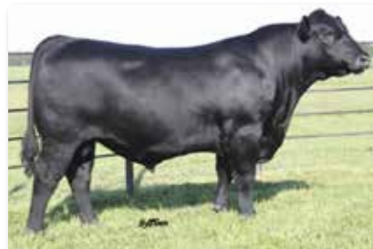
SYDGEN STRAIGHT UP 8998 MGS OF LOT 43