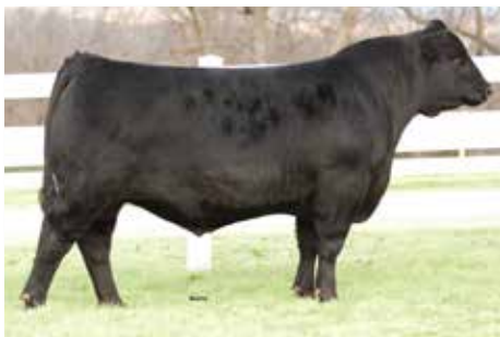
HAF PINNACLE 2026