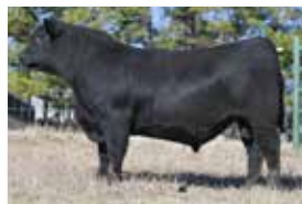
S A T TREASURE 9206 SIRE OF LOT 34A