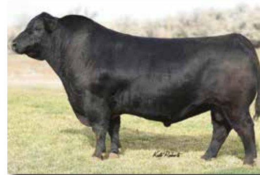
MUSGRAVE 316 EXCLUSIVE SIRE OF LOT 41 & 44