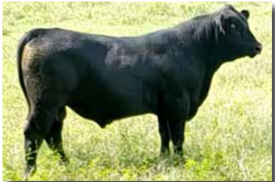
DHT TITUS 412 ACCLAIM A23

Acclaim A23 has a 104 Weaning Weight EPD, 189 Yearling has a 76 pound birth weight, 10 EPD's in top 1% of Angus breed. Out of a first calf heifer going back to Byergo Titus who had a 1013 weaning weight. On top side he goes back to Acclaim who has 7451 genomic progeny. He is top bull in sale for these EPD's Top 1% for WW