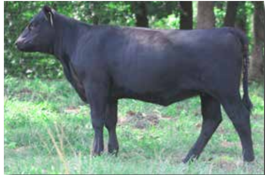
4N RITA 202

Stylish, deep ribbed and sound show heifer prospect sired by Growth Fund. Hard to find a better pedigree than this female's. We have retained her dam, 7N11's first two females back into the herd so we are offering one of our best with this lot. She has a great, and balanced EPD profile to go along with her excellent look. Will be broke to tie by sale day.