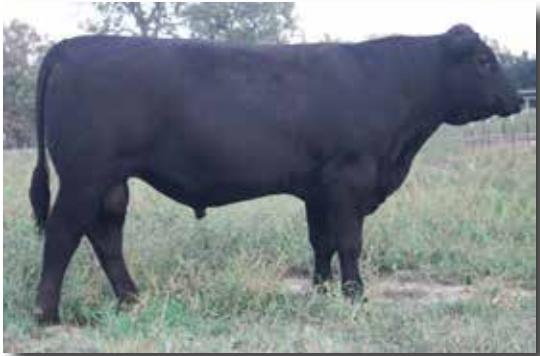
WRR ENHANCE 165

Consigner: Wiles Ridge Ranch Truman Wiles 417-252-0726 VERY COMPLETE PACKAGE ENHANCE SON. 165 has a TOP of the line EPD profile with a Top 10% $BEEF and a Top 5% $COMBINED INDEX of 300 $C. He is Show-Me-Select qualified with a +7 CED. 165 has a Top 30% WW EPD and a TOP 15% YW EPD. He has a TOP 3% Milk EPD of 37. His Marb EPD of 1.12 puts him in the top 10% of the breed. He has excellent body length, good frame at a 7.1 frame, with very good ease of movement. There is only one other bull in the breed that can match his combination of BW, WW, YW, RADG, SC, HP, CEM, MARB, and MILK EPDs. He is from the most productive cow family in our herd, his 15 year old pathfinder great-grandam is raising her 13th natural calf with a 381 day calving interval. She has accomplished this with being flushed two times and producing nine other embryo calves for a total production of 22 calves.