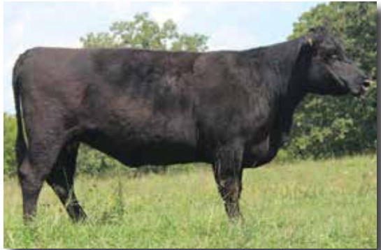
4N 10X BLACKCAP 611