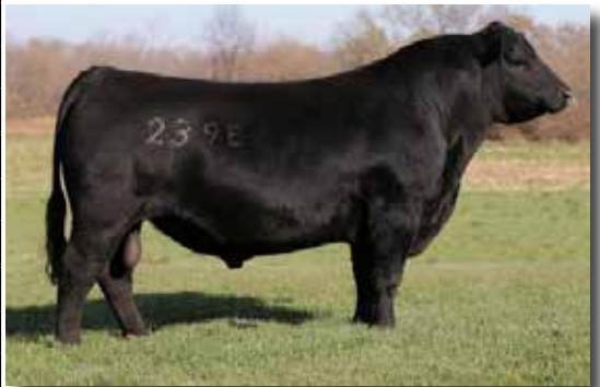
SIRE OF LOT 22 Ferguson Trailblazer 239E

BW 76; ADJ WW 667; ADJ YW 1351; PW ADG 4.28; ADJ YR FRAME 6.3 FootNotes: CEM 11 Top 30%,