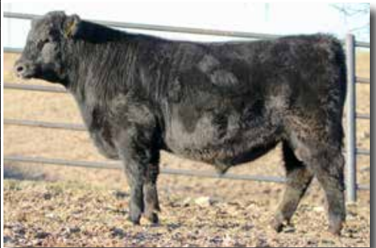
LOT 32 WRR Trailblazer 308

BW 60; ADJ WW 860; ADJ YW 1108; PW ADG 1.55; ADJ YR FRAME 6.5 FootNotes: DOC 27 Top 15%, HP 13.7 Top 35%, CEM 15 Top 3%,