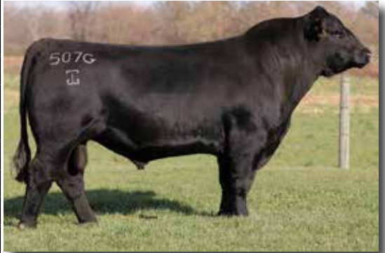
SIRE OF LOT 22 G A R Dual Threat

BW 67; ADJ WW 663; ADJ YW 1134; PW ADG 2.94; ADJ YR FRAME 6.2 FootNotes: DOC 22 Top 35%