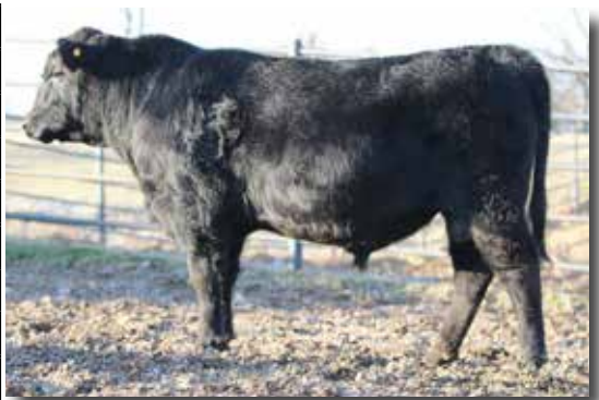
LOT 28 WRR Peyton 276

BW 58; ADJ WW 620; ADJ YW 1015; PW ADG 2.47; ADJ YR FRAME 6.6