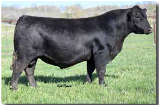
SIRE OF LOT 21 Williams Hollywood 700-380

BW 77; ADJ WW 796; ADJ YW 1394; PW ADG 3.74; ADJ YR FRAME 6.5 FootNotes: RADG 0.31 Top 15%, YH 1.1 Top 5%, DOC 22 Top 35%, CW 69 Top 15%