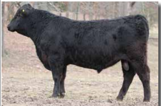
LOT 29 WRR Enterprise 278

BW 70; ADJ WW 845; ADJ YW 1377; PW ADG 3.33; ADJ YR FRAME 7.4