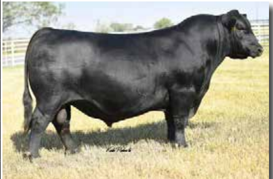
SIRE OF LOT 19 DB Iconic G95

BW 72; ADJ WW 806; ADJ YW 1182; PW ADG 2.35; ADJ YR FRAME 6.0 FootNotes: CEM 12 Top 20%,