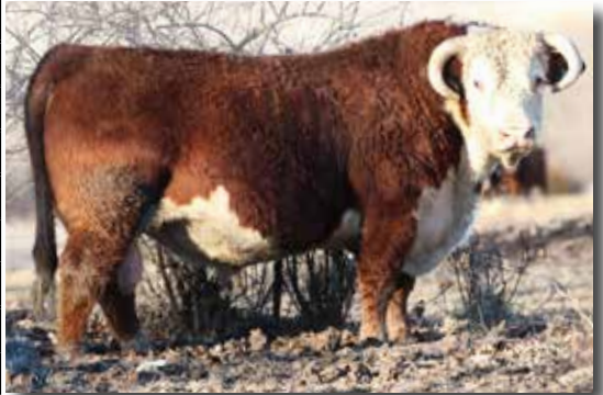
SIRE OF LOT 5 LF CHURCHILL 9089G

BW 76; ADJ WW 679; ADJ YW 982; PW ADG 1.89; ADJ YR FRAME 5.1 FootNotes: MG 62 Top 22%, MCE 3.8 Top 29%, MCW 80 Top 30%