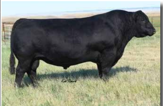
MGS OF LOT 12 SydGen Enhance

BW 60; ADJ WW 593; ADJ YW 1271; PW ADG 4.24; ADJ YR FRAME 6.3 FootNotes: RADG 0.37 Top 1%, YH 1.0 Top 10%, CEM 11 Top 25%, CW 80 Top 3%