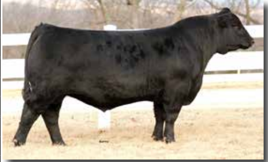
SIRE OF LOT 11 HAF Pinnacle 2026

BW 73; ADJ WW 905; ADJ YW 1333; PW ADG 2.68; ADJ YR FRAME 6.5 FootNotes: RADG 0.29 Top 25%, YH 0.8 Top 25%, HP 18.1 Top 4%, CW 62 Top 25%