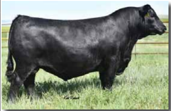
SIRE OF LOT 18 LAR Man In Black

BW 64; ADJ WW 859; ADJ YW 1289; PW ADG 2.69; ADJ YR FRAME 6.1 FootNotes: RADG 0.33 Top 10%, YH 0.8 Top 25%, DOC 25 Top 20%, CEM 11 Top 25%, CW 83 Top 2%