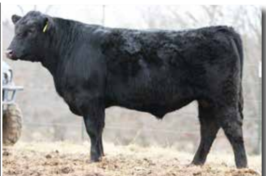
LOT 30 WRR Gavel 282

BW 73; ADJ WW 720; ADJ YW 1238; PW ADG 3.24; ADJ YR FRAME 7.3