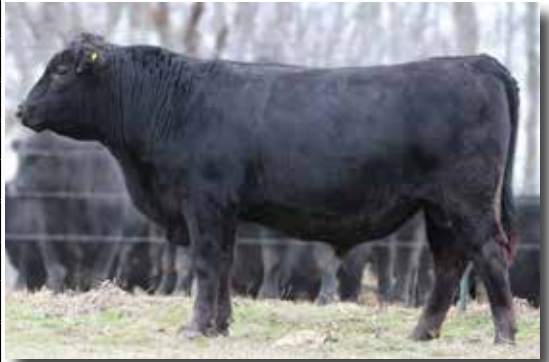
LOT 31 WRR Peyton 303

BW 62; ADJ WW 665; ADJ YW 1255; PW ADG 3.69; ADJ YR FRAME 7.5 FootNotes: RADG 0.31 Top 15%, YH 1.0 Top 10%, CW 67 Top 15%