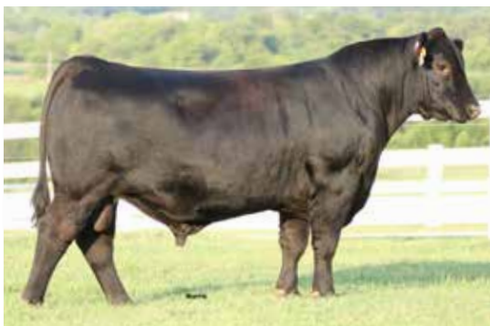
SIRE OF LOT 26 Valley View Niagara 9165

BW 70; ADJ WW 667; ADJ YW 1327; PW ADG 4.13; ADJ YR FRAME 6.4 FootNotes: RADG 0.28 Top 35%, HP 14.5 Top 25%, CW 62 Top 25%