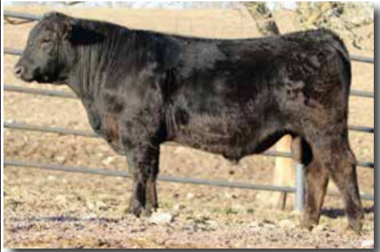
LOT 27 WRR Peyton 268

BW 65; ADJ WW 715; ADJ YW 1222; PW ADG 3.17; ADJ YR FRAME 7.0 FootNotes: RADG 0.29 Top 25%, YH 1.1 Top 5%, HP 14.5 Top 25%, CEM 12 Top 20%, CW 60 Top 25%